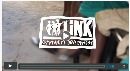
Link Community Development Malawi - Dedza Reading Clubs

In September, we launched our new Open Society Foundation funded Increasing Participatory Governance in Education in Malawi project. Building on our successful community-based school improvement planning, we will investigate why some community members are excluded from the school improvement cycle with the view to removing the barriers to participation.